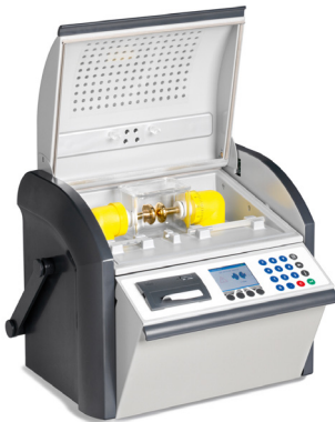
The figure is illustrative